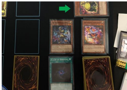
Use the empty space above the Graveyard for banished cards.