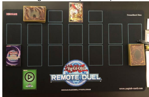
An example of a play area properly set up, with the entire field and all zones visible.