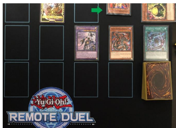
If you would give your opponent control of one of your own cards, turn the card upside down and have it half visible on the top half of your field in the designated column to indicate the correct card location.