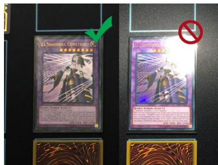
Lighting can cause glare on your cards. Arrange your setup so that your opponent can clearly see your cards, especially the name and artwork of the card.